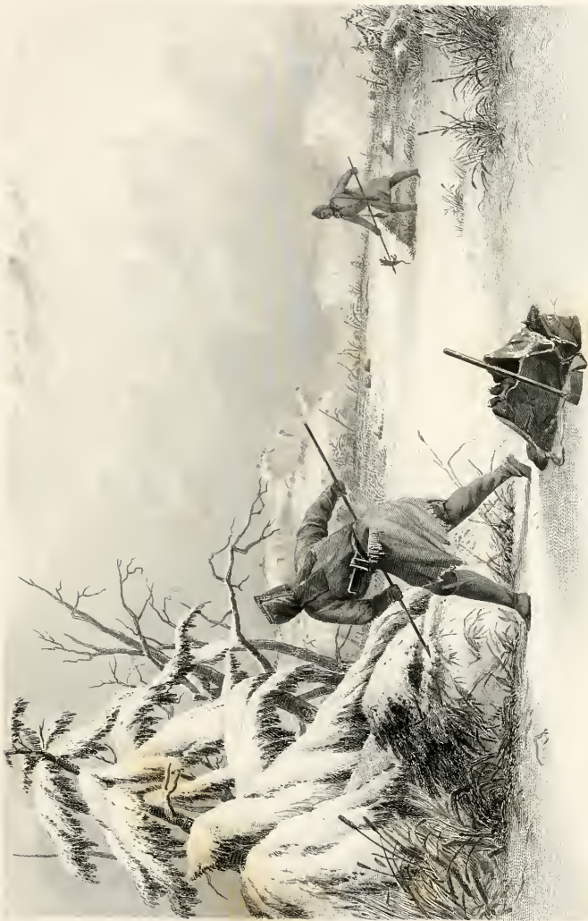
THE HUNTERS OF THE GREAT NORTH